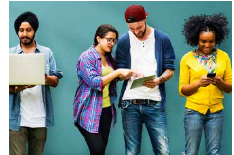
Choosing subjects and courses at 18