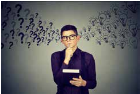
How to choose the right subject or course