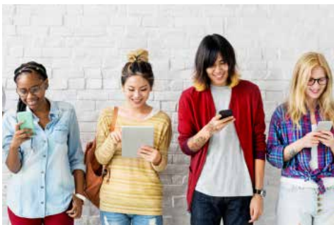
Options at 16